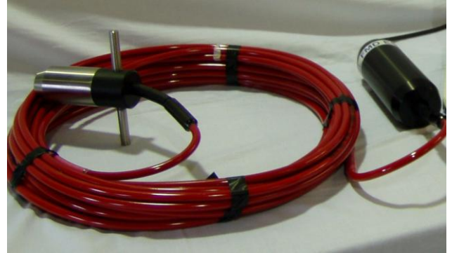
FMD Probe Applicator

This system is available for use with either Diver or ROV operation.