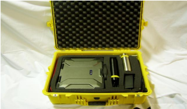
FMD system in transport case